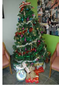
Lobby Christmas Tree

Special thank you to our Cristo Rey interns for putting up our Christmas tree and all that they do to help us each day.